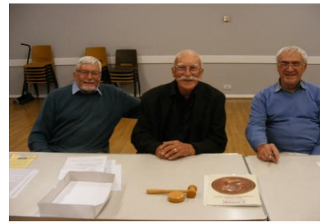
The A.G.M. Top Table