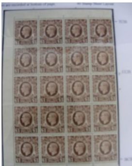
10/- half sheet