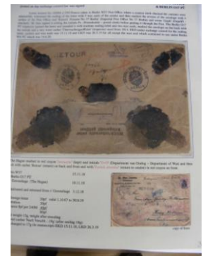
Opened and resealed !