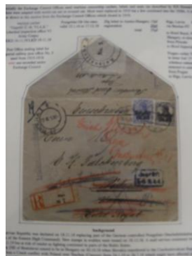
Went all over and and back again