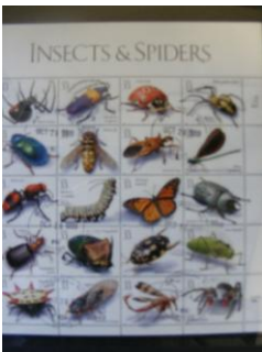
Insects and Spiders