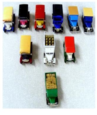
Graeme's transport !