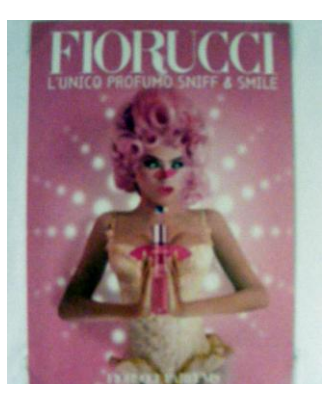
Sniff and Smile