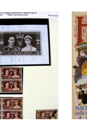
Flaws in the Coronation issues