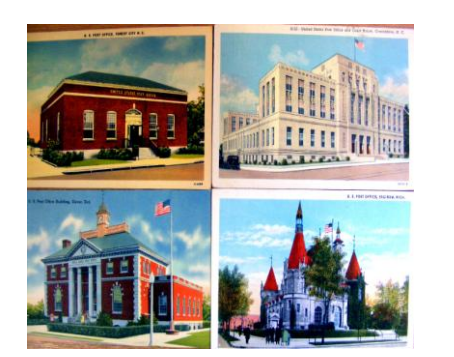
American Post Offices