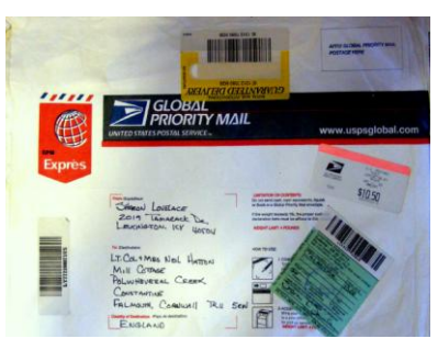
Neil's Large envelope