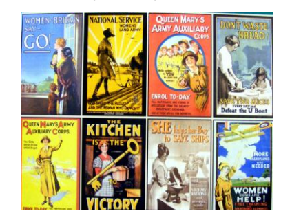
Wartime posters on jigsaws and on cards