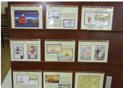
Zheng He sheets