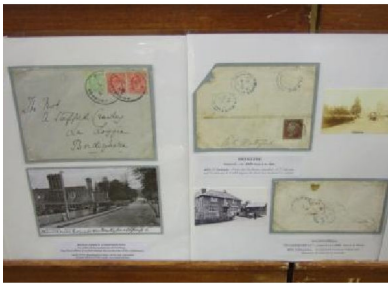
Some of Sue's lovely material