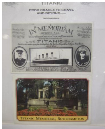
The Titanic Memorial