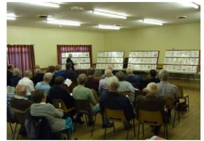
A full house