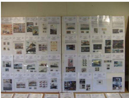
Some of Phillip's fantastic display on the Titanic