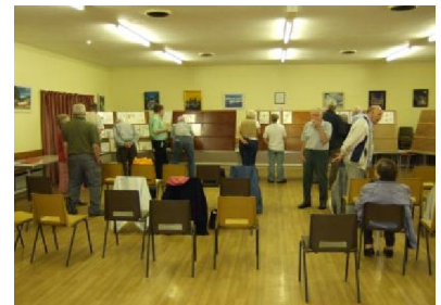
5 sheets to view