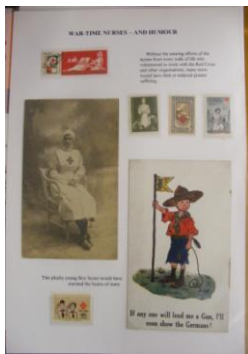
War-time nurses and a scout