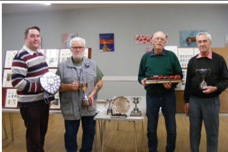
The Christmas Competition Winners.

Back page - Club Stamps, Future Events, Society data.