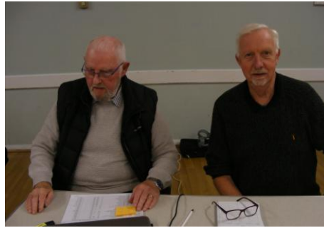
The Financier and Recorder