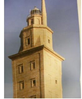
The Malaga lighthouse