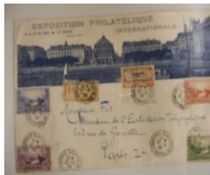
Expo-Philatelic lovely letter