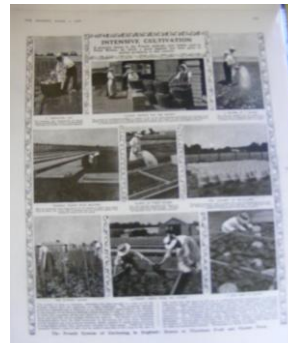
Early fruit and Veg