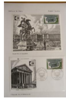
French Air Mails