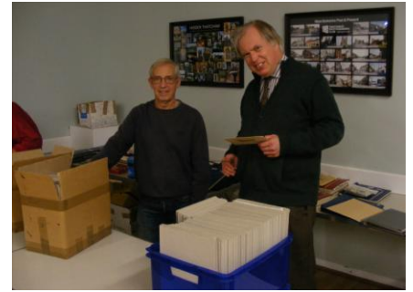
The Box Boys