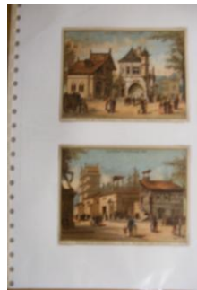
Expo cards of 1890