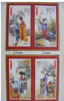
Some Jingling Beauties