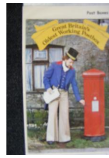
The Oldest Post Box