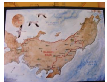
Matsuo Basho's route around Honshu