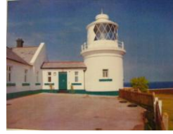
Durlleston lighthouse in Dorset