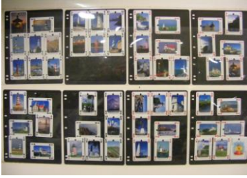
A pack of lighthouses from around the USA