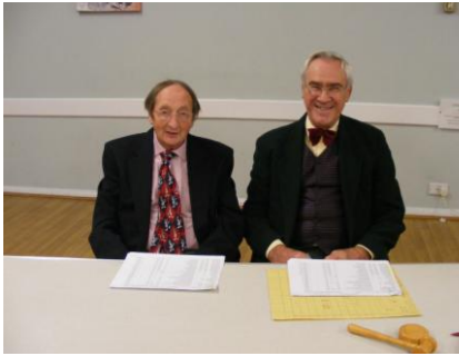
The Auctioneer and Scrutineer