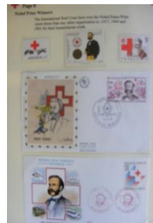
Nobel Prize Winners