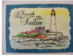
A NZ lighthouse on a lovely card